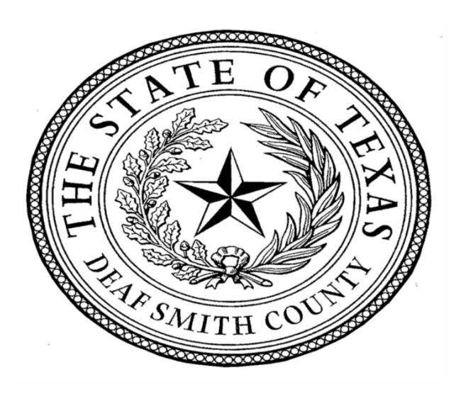
Deaf Smith County Personnel Policy Manual